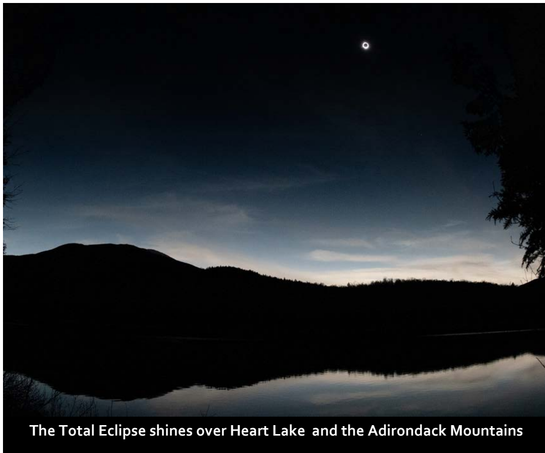
The Total Eclipse shines over Heart Lake and the Adirondack Mountains